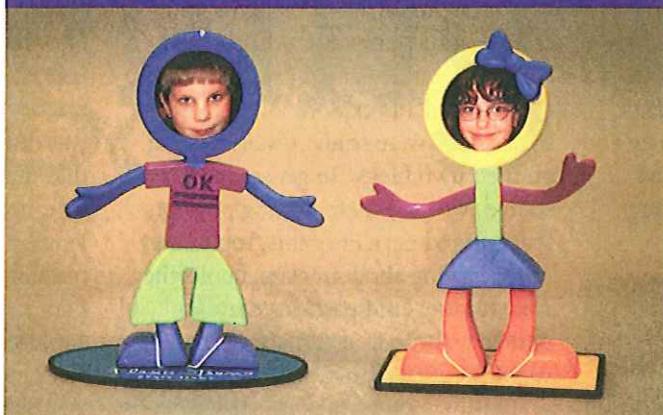
FIGURE 1. Photo People

To affirm blogging successes, teachers posted student photos, labeled with their blogging success stories.